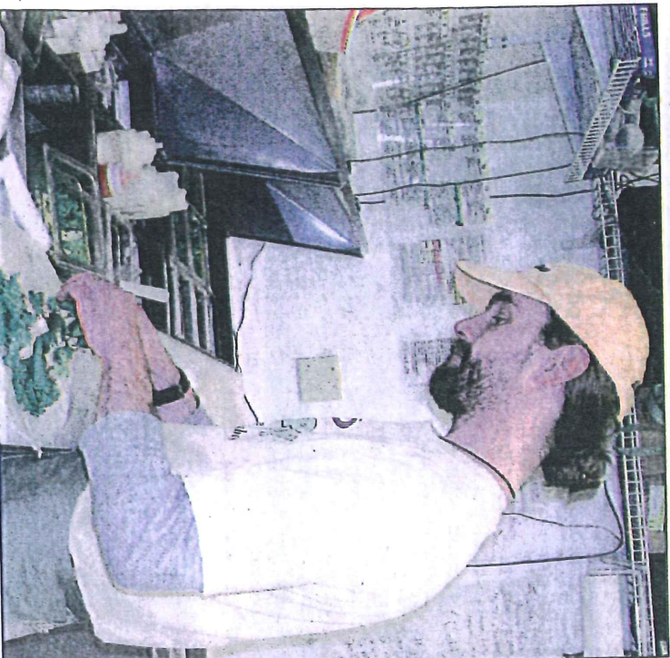
Known for their extraordinary taste, Roly Poly sandwiches are delicious and unique.

Convenient to Lynchburg College and several area busi-